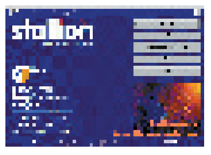
Figure 3 - Auto Start Screen